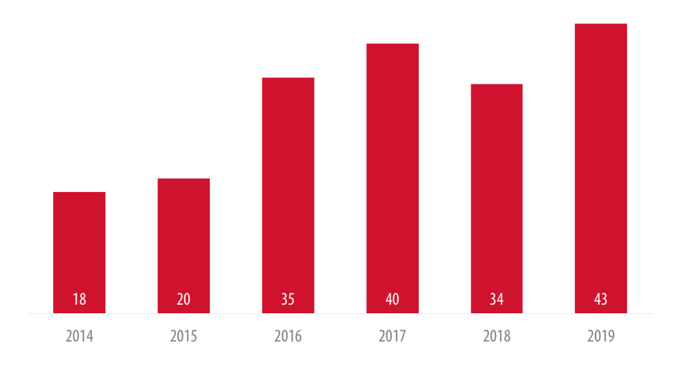
Figure 1. Utah Department of Health Children's Hearing Aid Program (CHAP) participants increased to an overall high of 43 in 2019.

1. Centers for Disease Control and Prevention (CDC) Last reviewed 2019. Retrieved from: cdc.gov/ncbddd/hearingloss/data.html.