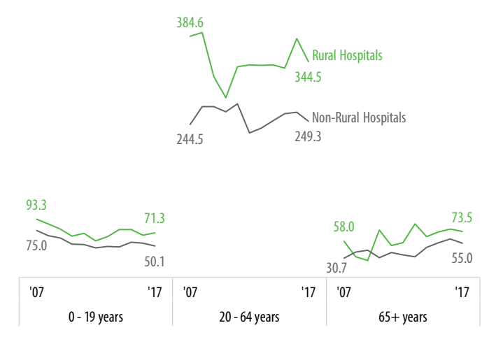
Figure 2 . Oral health ED visits occurred at a higher rate in rural hospitals vs. non-rural hospitals between 2007–2017 (rates per 100,000 population).

Rates were adjusted by population estimates for patient age and geographic residence